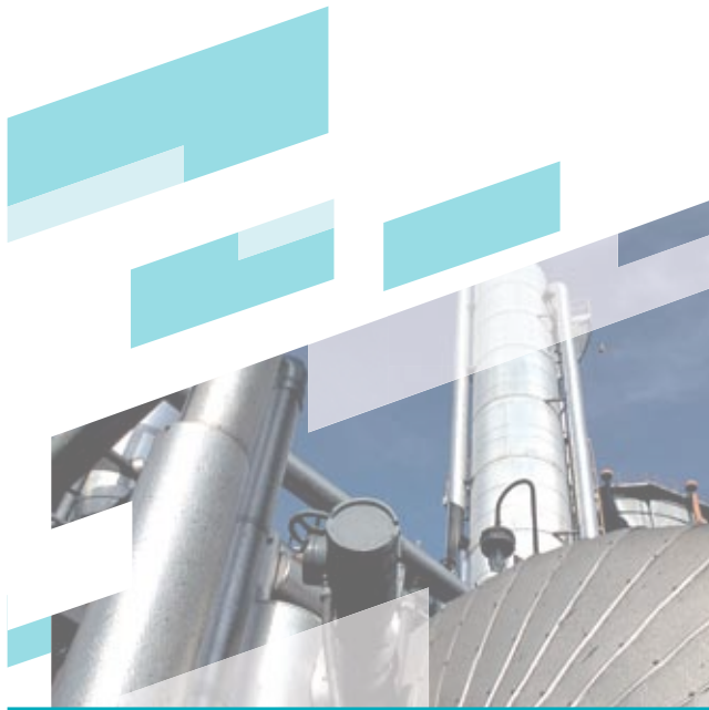
ABB currently offers a comprehensive range of Part Turn and Linear Actuators in standard and Explosion-proof configurations.

In addition, ABB's electronic control units, with control panel, are available in integrated field installation and rack-mounting configurations.